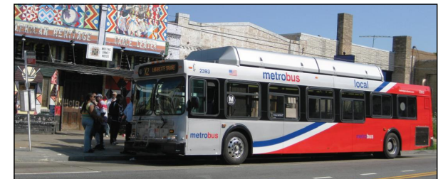
A new local bus stops to pick up riders along the X2 route. Metro is reviewing recommendations to improve service along the Benning-H corridor.

(Please see inside for details about the improvements.)